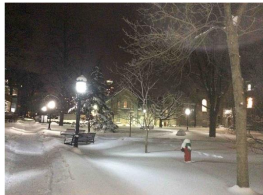
Toronto University Campus